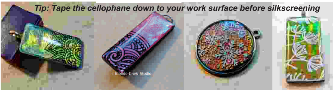
Tip: Tape the cellophane down to your work surface before silkscreening