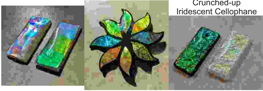
Crunched-up Iridescent Cellophane