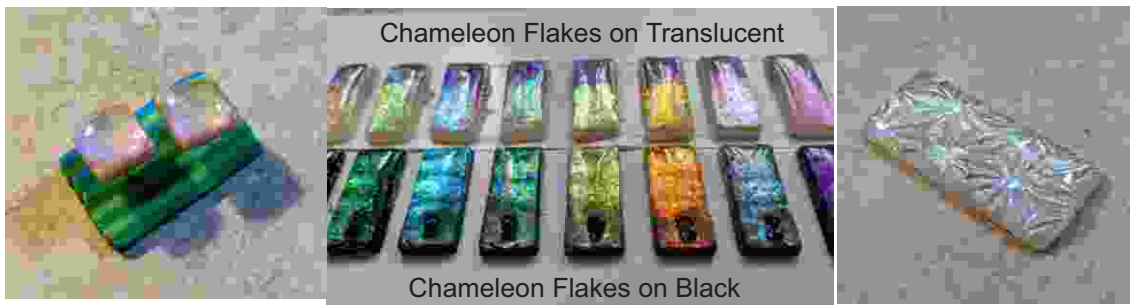
Chameleon Flakes on Translucent