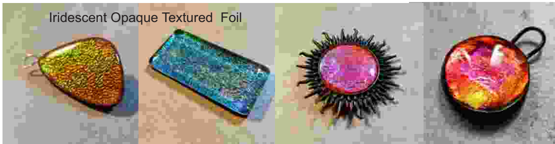
Iridescent Opaque Textured Foil